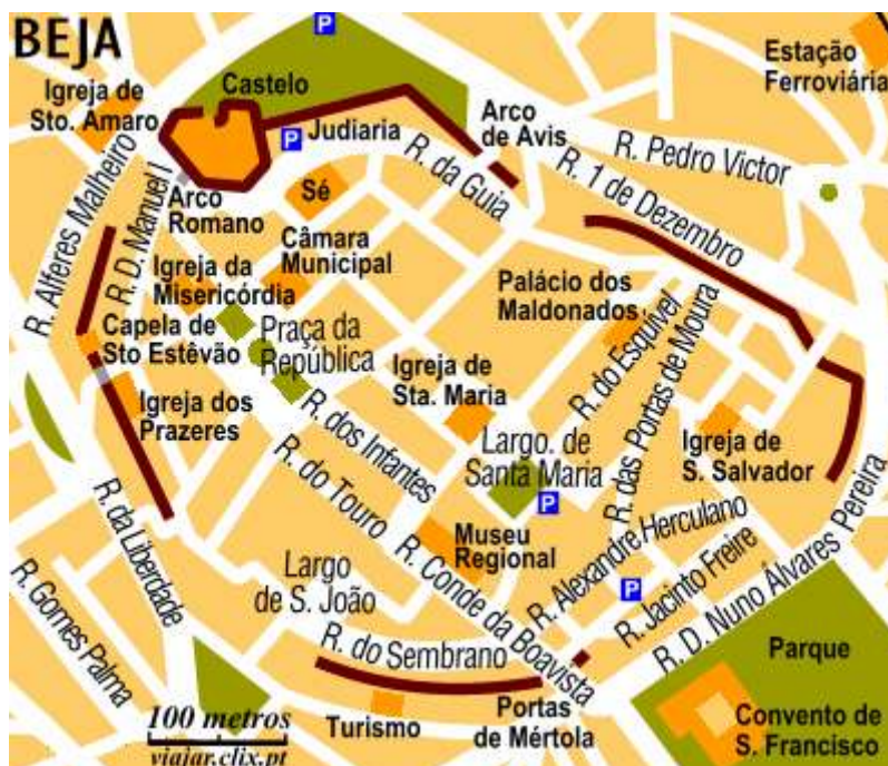
Center of Beja

If you arrive by train or by bus, you should take a taxi to get you to the students residence. The price for the taxi run to the students residence is between 4 and 5€. In the bus and train station, there will be taxis there, but in case you have to call one, the phone for the taxi central is: 284 322 474. The address for the students residence you should give the taxi driver is: Rua Dr Manuel Gomes Serrano nº 1 7800 Beja.